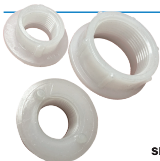
Shown in the photo raised and flush fittings.

#56HD 1-1/2" raised fit #57HD 1-1/2" flush fitting Optional threaded fitting for sending unit.